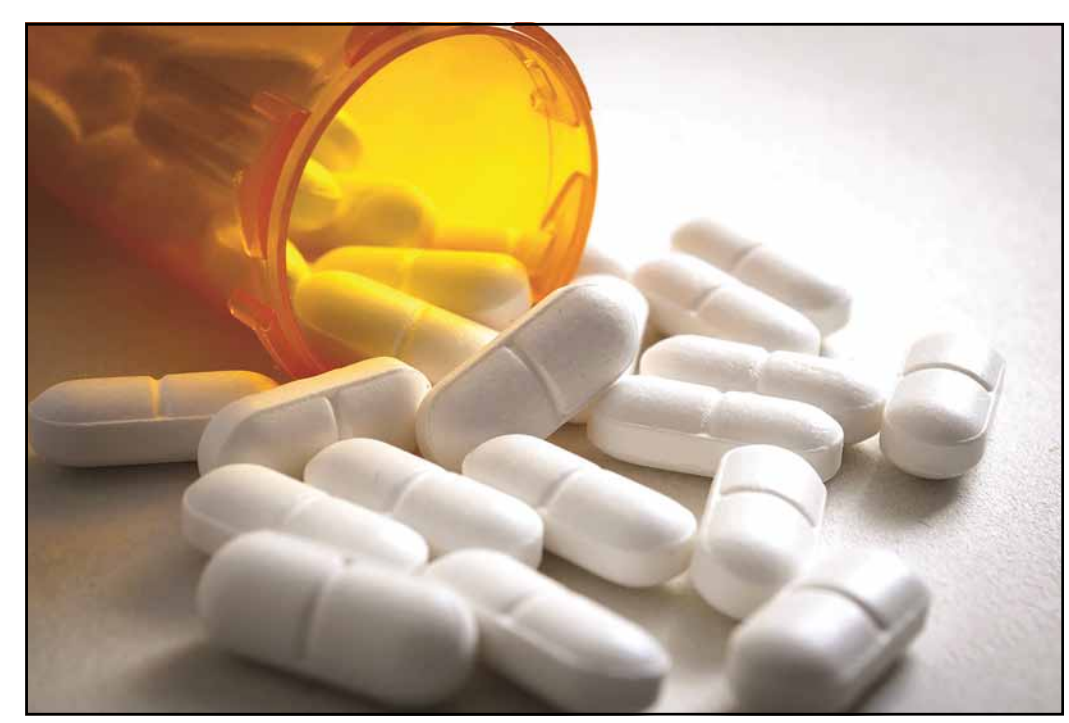
Substance abuse in teens continues to be an issue, ranging from alcohol and marijuana to prescription drug misuse and vaping.

Mowrey suggests that the reactions and conse-