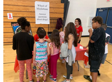
Students play the "Wheel of Misfortune" to learn about the negative consequences in taking