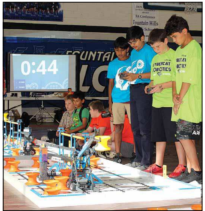
On Oct. 27 Fountain Hills High School hosted over 30 schools from across the state to compete in a robotics competition. Teams were tasked with both autonomous and radio control challenges.