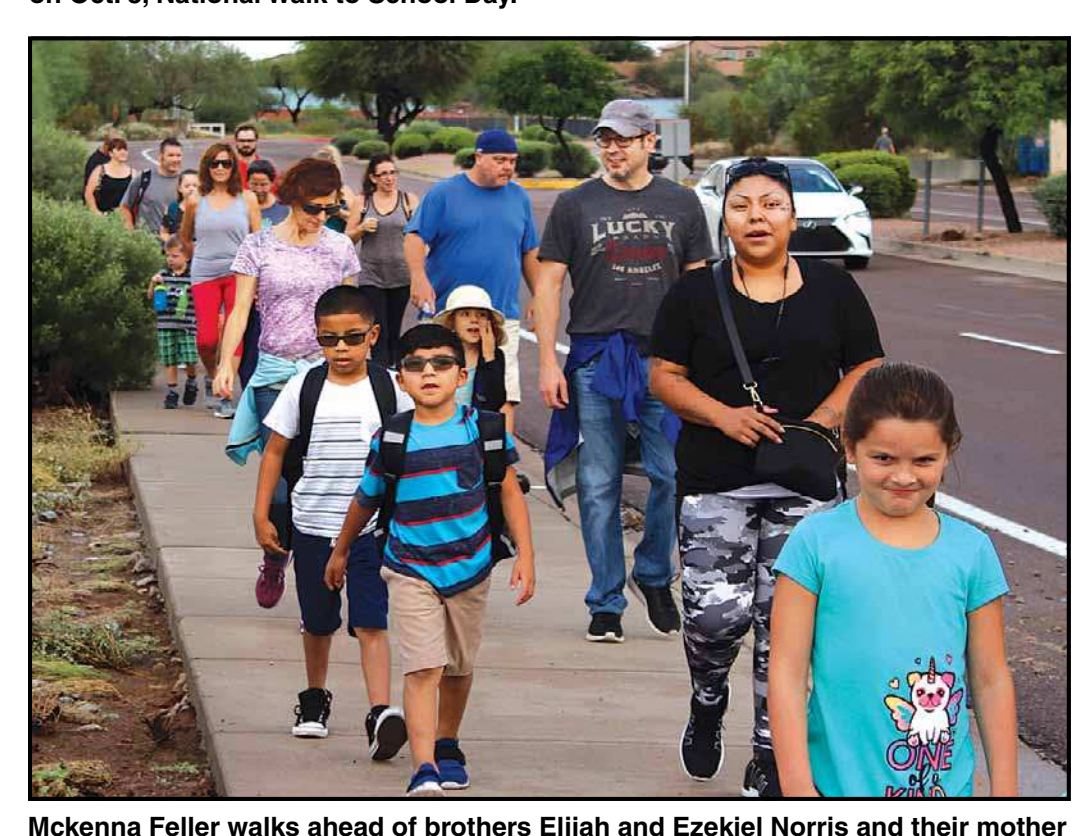
as McDowell Mountain Elementary School students walk to school on National Walk to School Day.