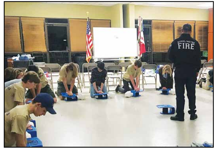
Boy Scout Troop 343 practices CPR lessons under the tutelage of the local fire department.

Boy Scout Troop 343 meets Monday evenings at 7 p.m. at Church of the Ascension, 12615 N Fountain Hills Blvd, in Fountain Hills. Boys age 12 and older